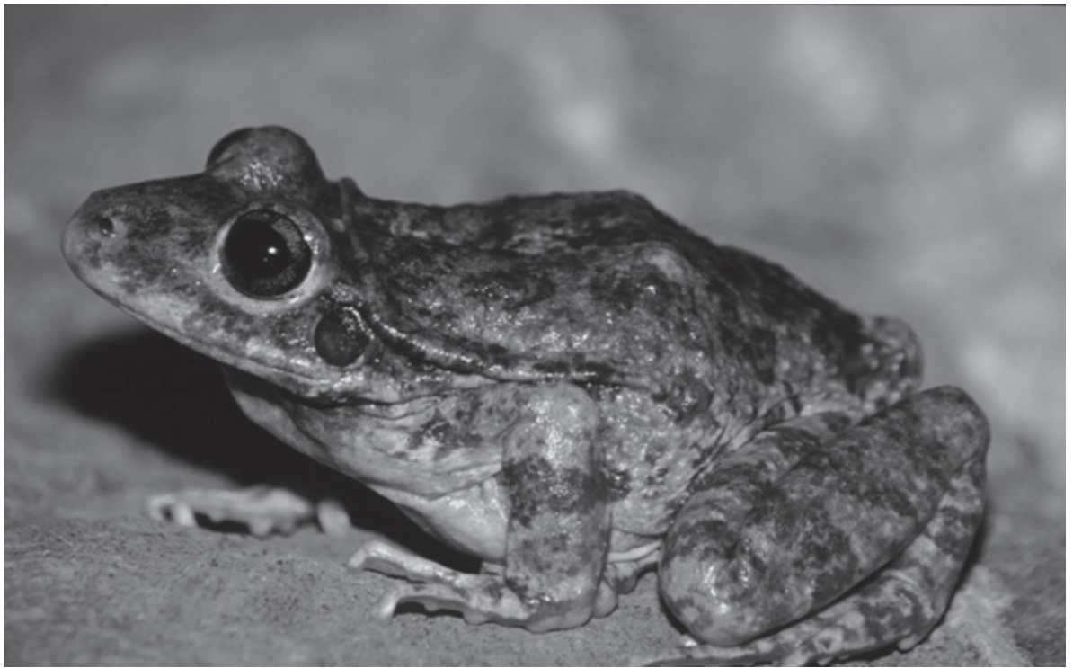
Barking Frog ( Eleutherodactylus augusti) from Cochise Co., AZ.