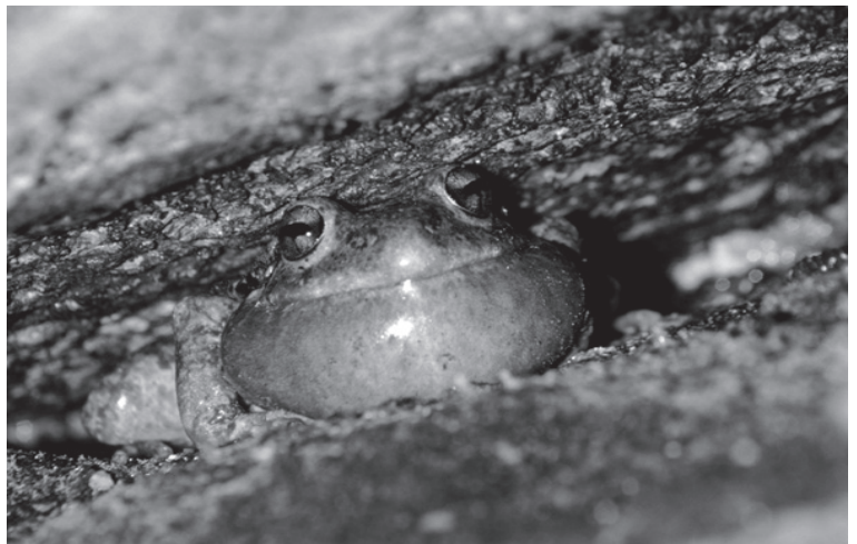
Barking Frog ( Eleutherodactylus augusti ) from Cochise Co., AZ.

Barking frogs can be distinguished from all other anurans in Arizona by the fold of skin across the back of the frog's head and the well-developed tubercles on their feet. They are terrestrial and commonly found on cliffs, caves, and rock outcrops in a variety of biotic