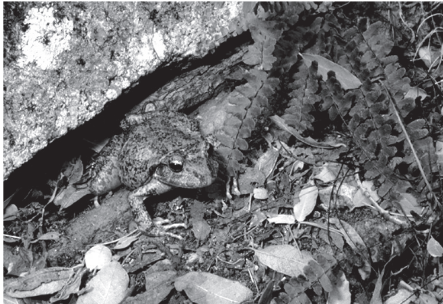
Barking Frog ( Eleutherodactylus augusti) from Pima Co., AZ.

In the wild, barking frogs have been known to eat camel crickets ( Ceuthophilus sp.), field crickets ( Acheta